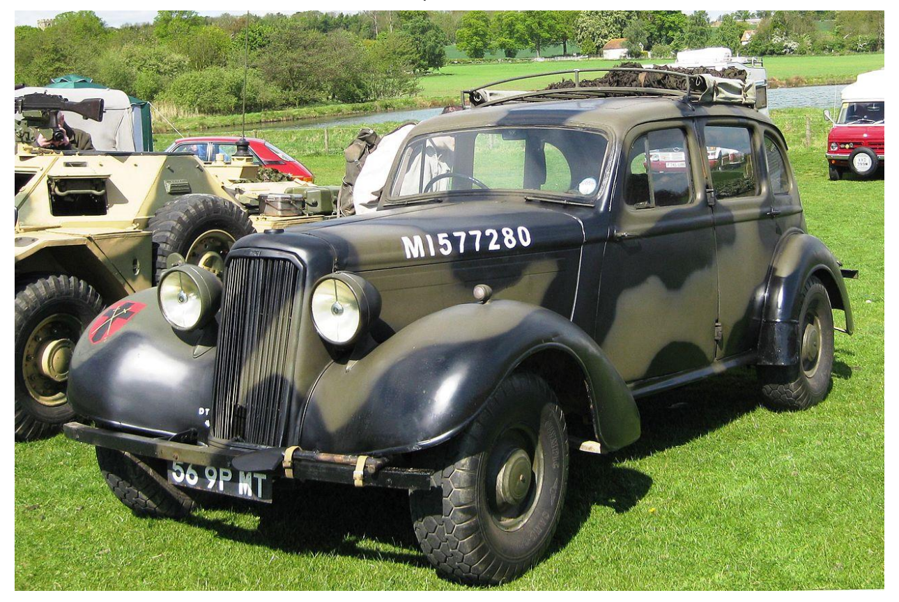
Anyone have any idea what this car is?

Submit your answer to <a href="Mewsletter@calgarymgclub.org">Newsletter@calgarymgclub.org</a>